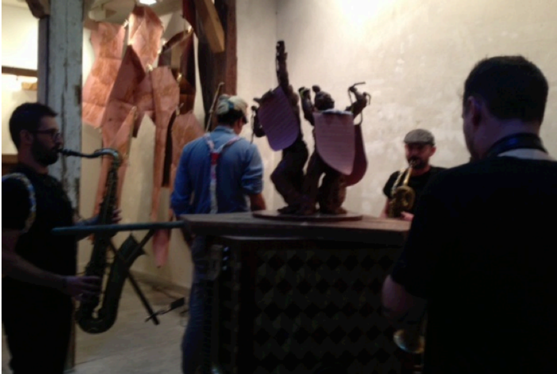
A moment of the performance 3 sax players, artist spinning the plate