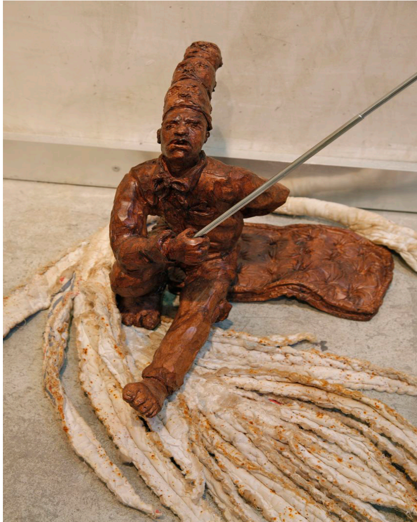
The receiver 2013 Terra cotta, patchwork and antenna 34 x 50 x 49 cm