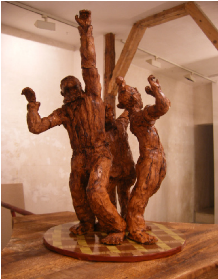
Hurdy Gurdy 2013 Detail terra cottas