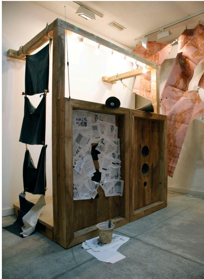
Tap Booth Sound installation Wood, 6 speakers, lights, leather curtain, antenna, afro pick, paper 240 x 180 x 124 cm

The second element of the exhibition is a tap performance booth with an amplified floor. This structure hides the performer body but not his head while amplifying the sound of his tapping and distorting it to sound like gunfire. The façade of the booth serves as panels for the wheat pasting of documents, which consist of prints of a children's book ("The First Book of Rhythms") of the Harlem Renaissance poet Langston Hughes ritualistically wheat pasted to the surface during the performance.