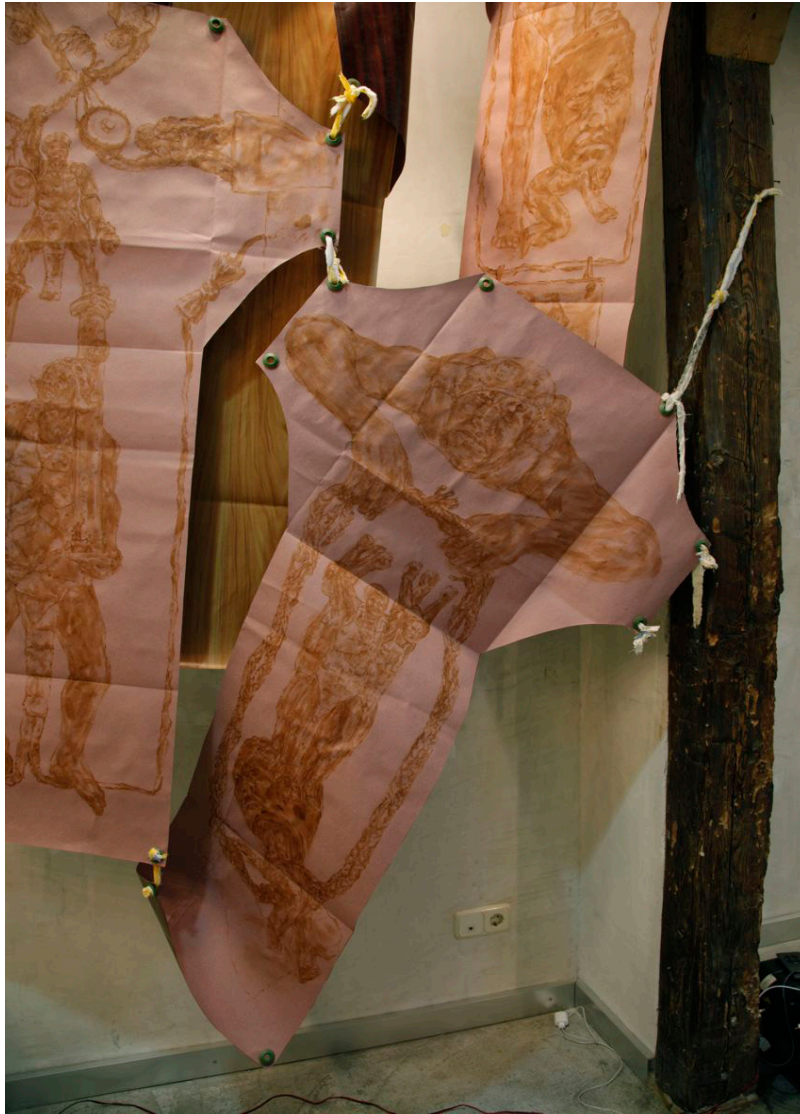
Painted curtain 2013 Detail paintings