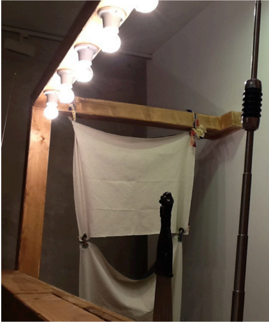
Tap Booth Sound installation Detail