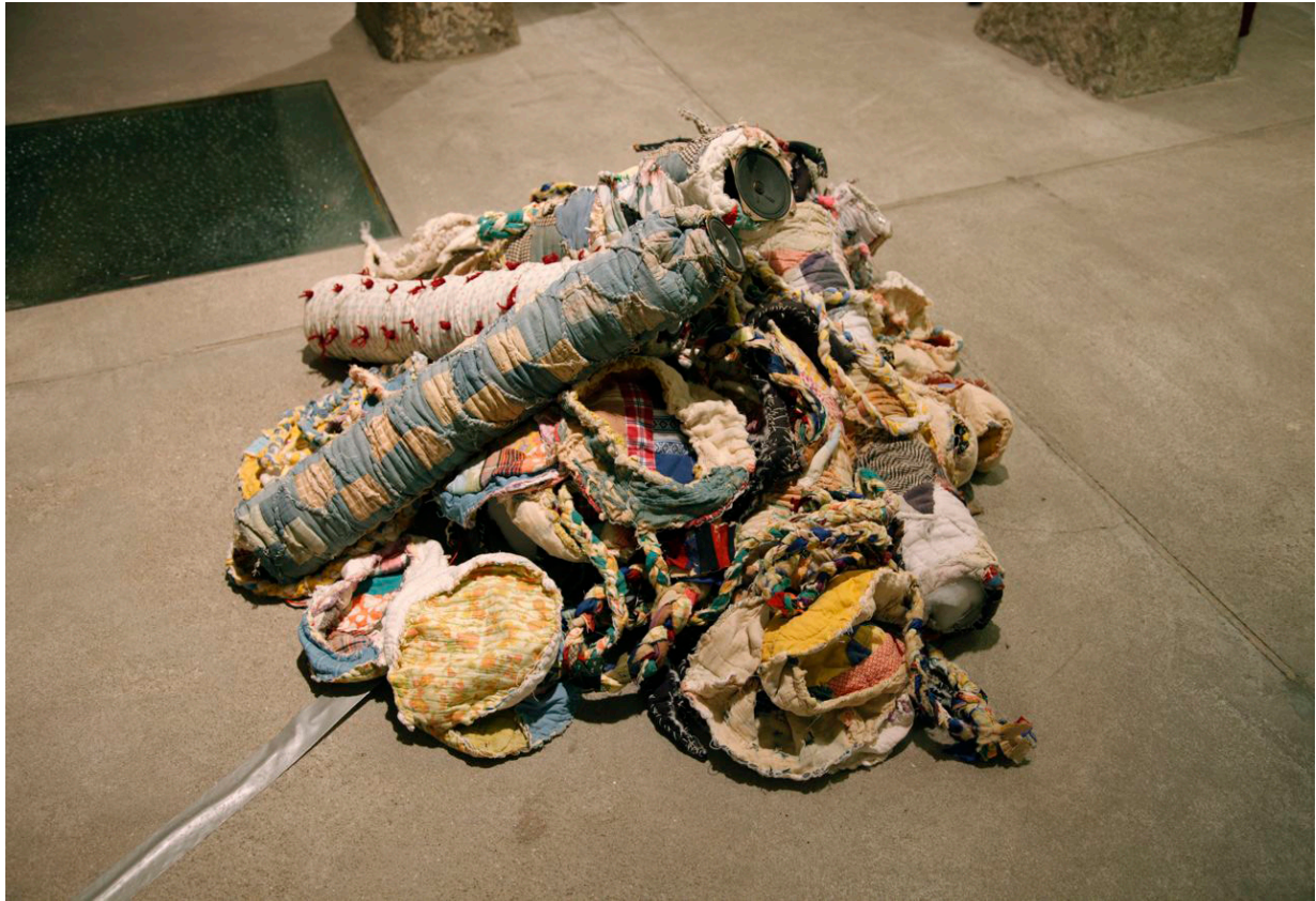
Firewood 2013 Subwoofers, fabric, tubes 140 x 50 x 110 cm

Another element of the exhibition is a small pile of quilted speaker tubes, made of patchwork that remind of the African American tradition. Taking their form from a pile of cut palm tree wood, these quilted surfaces become the coverings for small subwoofers that will echo a sound work based on the sound of historic performances of tap dance. It consists in a pile of military berets hand quilted from fragments of American quilts.