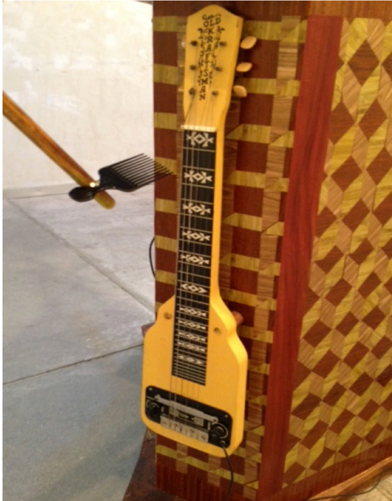
Hurdy Gurdy 2013 Detail guitar