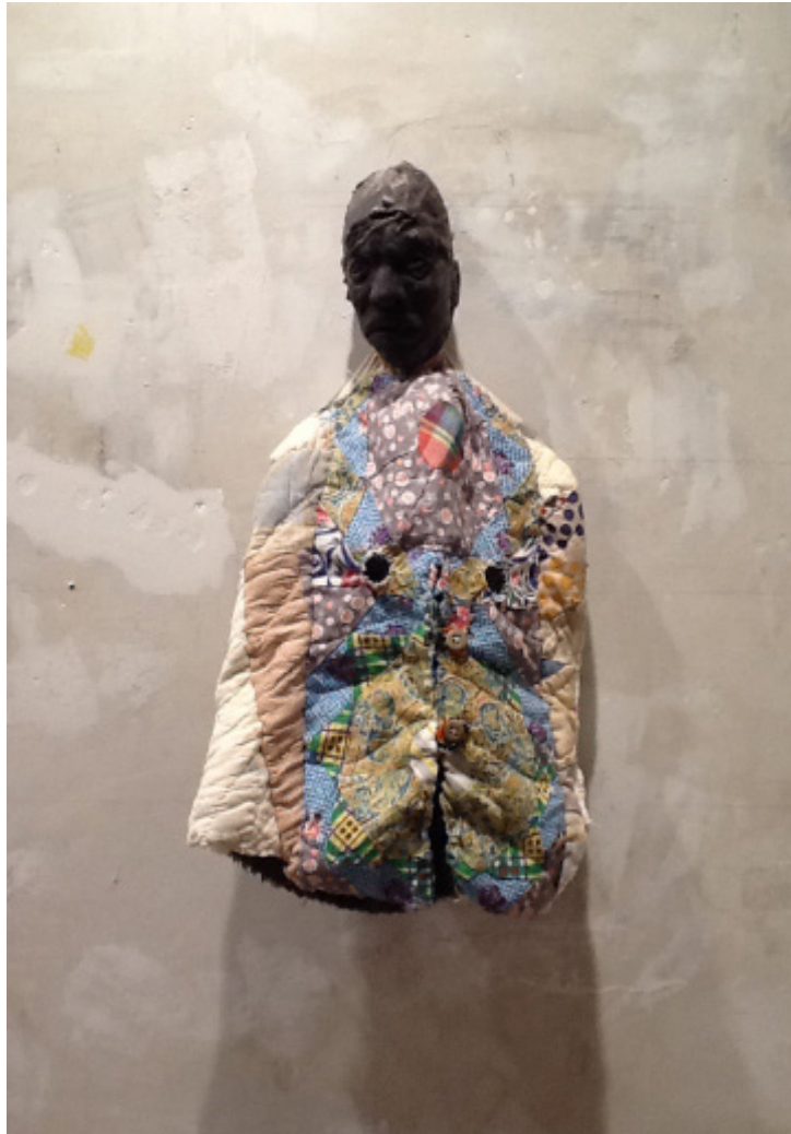
Mask 2013 Wax, patchwork 52 x 29 x 10 cm