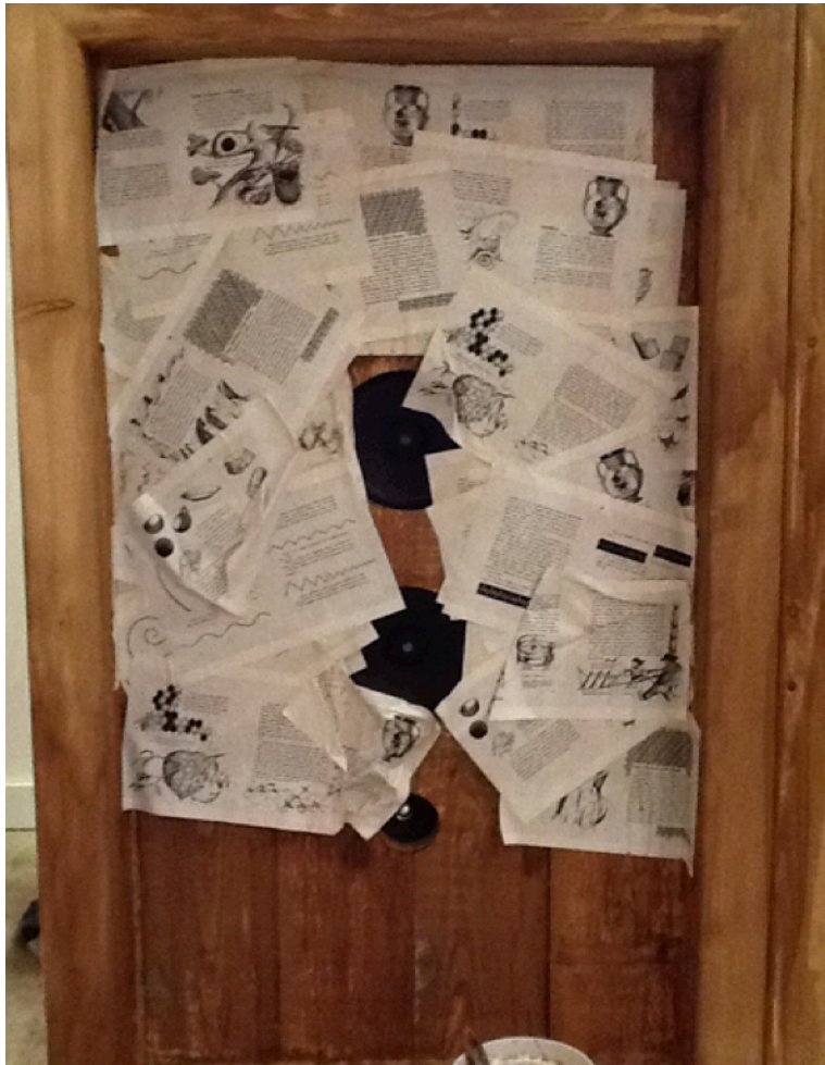
Tap Booth Sound installation Detail of the façade with documents pasted